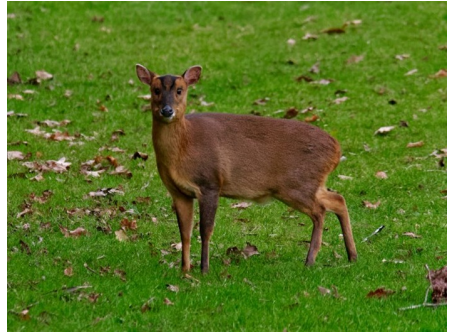
A Montjac Deer

For some months now we have had a trip planned to visit relations in the beautiful County of Suffolk – my family have a very long history in rural Suffolk and Essex so it is always a pleasure to return to my roots.