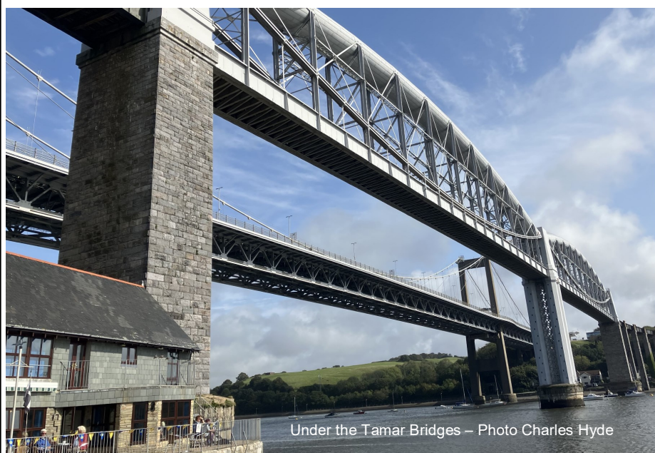
Under the Tamar Bridges