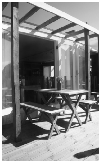
Alfresco dining by the sea

Please visit the facebook pages to check for special events especially designed with local people in mind ( facebook.com/BlackRockBeach ) or call the café on 01503 263651.