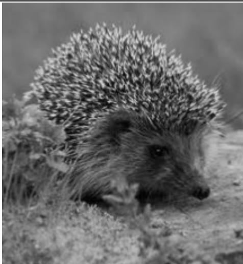
A rare sight today

the little hoglets are born about a month later – in a successful year it is possible to have two litters, producing five or six young each time. The young are born in nests of leaves and dry grass, often under garden sheds, wood stores as well as natural cover. One month later they leave the nest to forage with their mothers and after a further three or four weeks they are on their own. Those born late in the season will have to ensure they can achieve a healthy body weight to survive