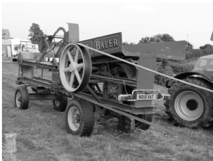
The vintage baler was demonstrated.

There was sunshine, laughter and the air was filled with the nostalgic smell of steam engines when I visited the Morval Steam Rally on Sunday. The atmosphere was electric and everyone appeared to be having a great time. There was a fantastic display of vintage vehicles which attracted large crowds, with people travelling from near and far to see them.