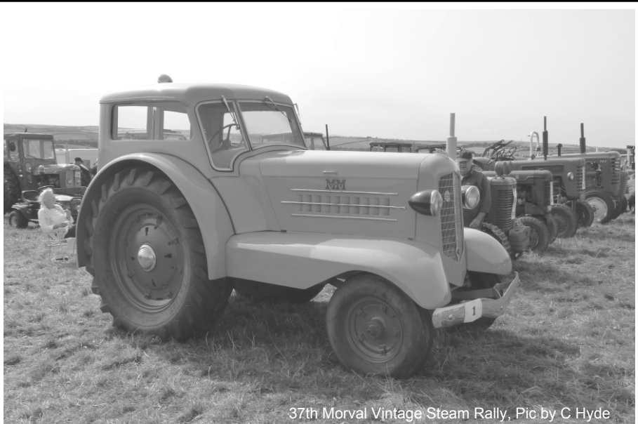
37th Morval Vintage Steam Rally