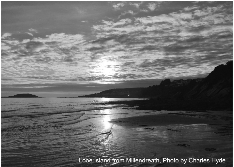
Looe Island from Millendreath