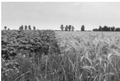
Help slow bio diversity loss

This article’s a bit of a niche one – or at least, it might sound it at first. Biodiversity’s not something we tend to think much about: it’s a word we might hear thrown about on nature documentaries occasionally (who doesn’t love David Attenborough), but do we really understand what it means on a small, community scale?